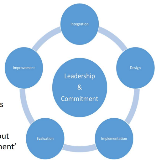
Figure 1—Elements of an Effective Risk Management Framework (Source: AS ISO 31000:2018 Risk management - Guidelines)